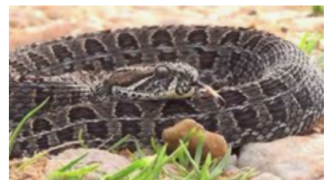
Berg Adder (Neurotoxic Venom)

Symptoms: tingling at the bite site, weakness, drooping of eyelids, difficulty in speaking and respiratory arrest. Onset of action is 2-6 hours.