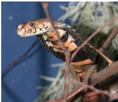
Mozambique spitting cobra (Cytotoxic Venom)

Symptoms: pain, redness and swelling around the bite site, small blisters, ulcers and may result in a slow healing ulcer and gangrene the and may result in loss of limb function. Onset of action is 10-30 minutes.