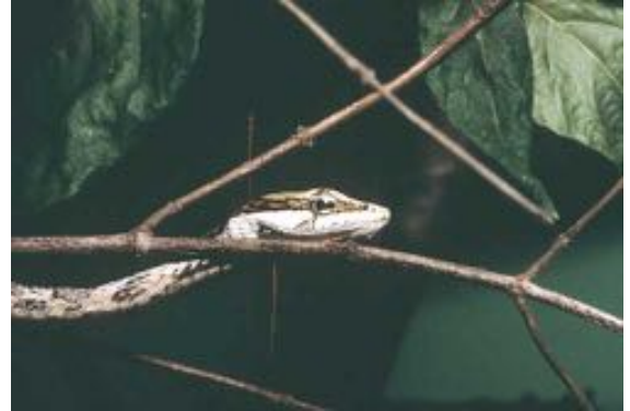
Southern Vine Snake (Haemotoxic Venom)

Symptoms: bleeding from the bite site, open wounds, bleeding from the nose, lungs, kidneys and stomach. Onset of action is slow over several days.