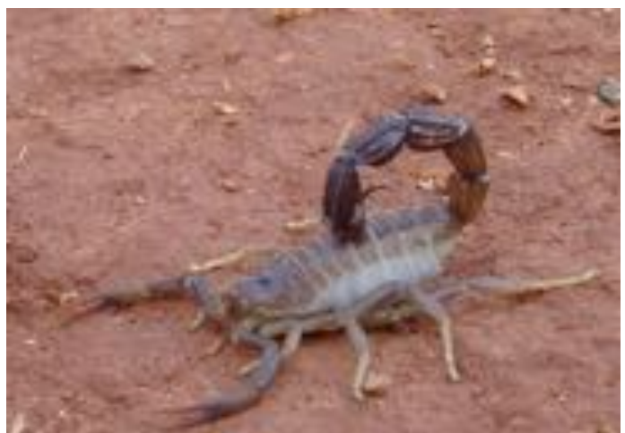
Highly Venomous Scorpion

Scorpions: Stings mostly cause severe local pain and sensitivity to touch, heat and cold. But some stings can cause muscle pains or spasms, a general sense of weakness, convulsions and coma. Scorpions with thick tails and thin pinchers are highly venomous ( neurotoxic ) and life-threatening.