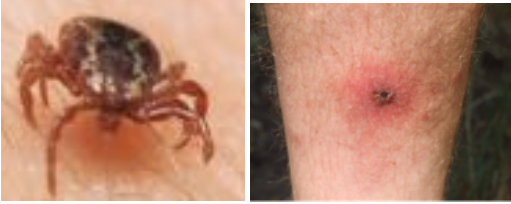
Tick bite with black infected centre

Tick bites: Usually occur when involved in outdoor activities and can lead to Tick bite fever. The tick head must be removed with tweezers and the area cleaned. Symptoms of tick bite fever (a bacterial infection transmitted by ticks) include fever, headache, weakness and skin rash.